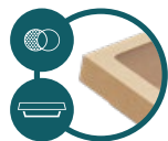
OneClick Paperlid flat