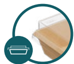
OneClick PET lid 20 mm