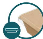
OneClick PET lid flat 0 mm