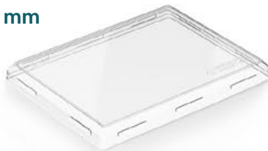
PET flat 0 mm