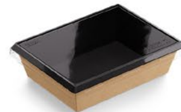
PET flat 2 sections 0 mm