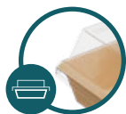
OneClick PET lid dome 40 mm